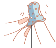
Pull the flap to secure.

Ventilation holes at the rear of the finger and the front center, combined with inner bumps keep the finger pad from sticking to your finger and minimizes sweat. The inner cushion provides both firmness and comfort for long working hours. The new material doesn't have the unpleasant rubber smell associated with other finger pads.